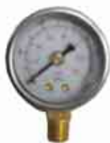
40mm Dry Bottom Entry