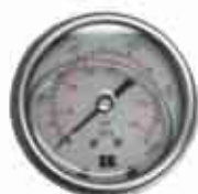
Liquid Filled Rear Entry