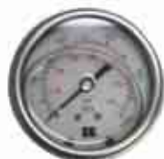
Liquid Filled Rear Entry