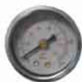
50mm Dry Rear Mount