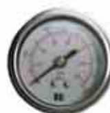
40mm Dry Rear Mount