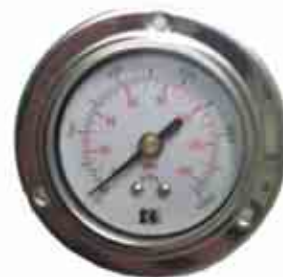
Gauge With Front Flange