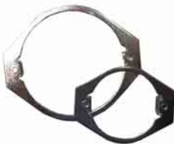
Panel Mount Kits