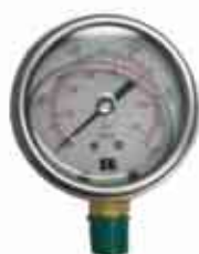
Liquid Filled Bottom Entry